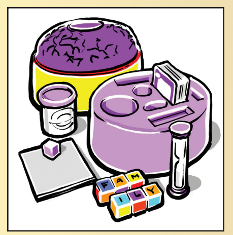
Pieces shown smaller than actual size.